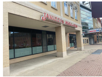
20 East Northampton St.