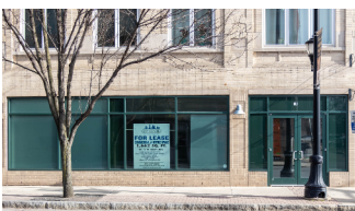
10 East Northampton St.