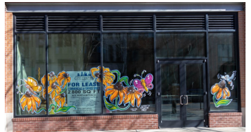
36 East Northampton St.